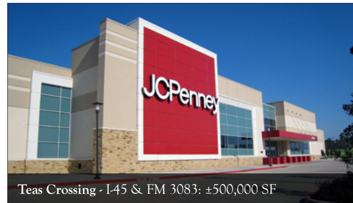
Teas Crossing - I-45 & FM 3083: ±500,000 SF