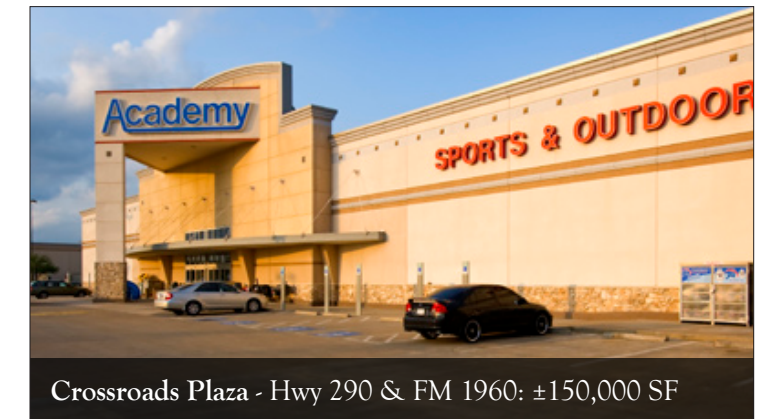
Crossroads Plaza - Hwy 290 & FM 1960: ±150,000 SF