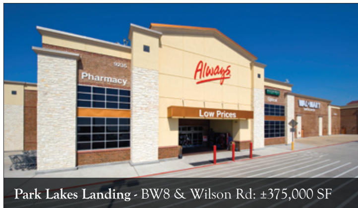
Park Lakes Landing - BW8 & Wilson Rd: ±375,000 SF