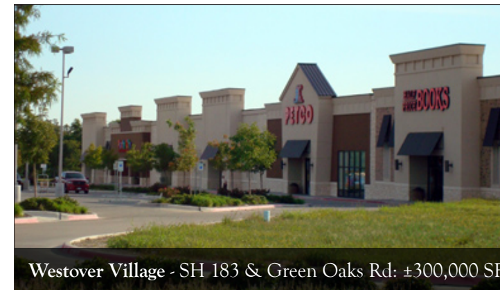
Westover Village - SH 183 & Green Oaks Rd: ±300,000 SF